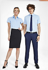
SOL'S EXCESS 17020