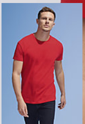
SOL'S Imperial 11500