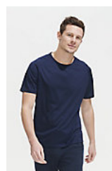
SOL'S SPORTY 11939