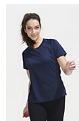
SOL'S SPORTY WOMEN 01159